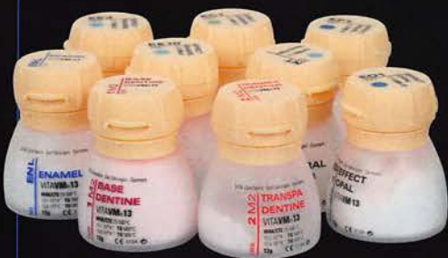
Used materials: VITA VM 13 ceramics on investment and refractory dies (GC Cosmotech)